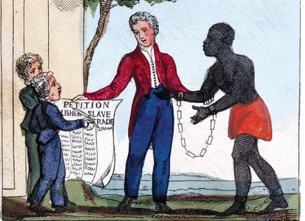
These pictures show how poorly the African people were treated, in very poor conditions.